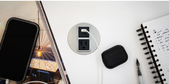
NODE | ON SURFACE POWER UNIT

CALIBER CONNECTORS ARE INCLUDED GROMMETS POWER & DATA WIRE MANAGEMENT