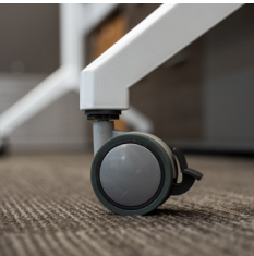
FLOOR PROTECTIVE CASTERS