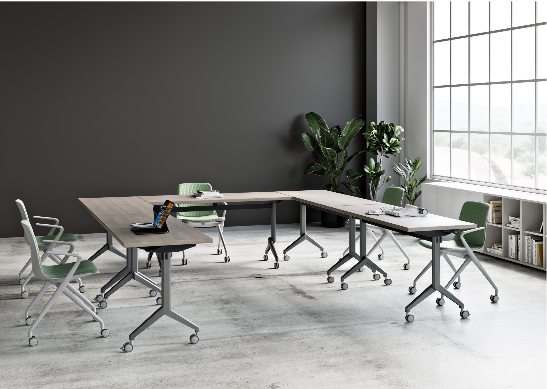
CALIBER | GREY ELM TOPS | METALLIC SILVER BASES

BEST VALUE Limited colors, shapes, and sizes