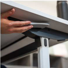
PADDLE RELEASE HANDLES