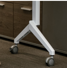
MULTIFACETED COLUMN AND FEET