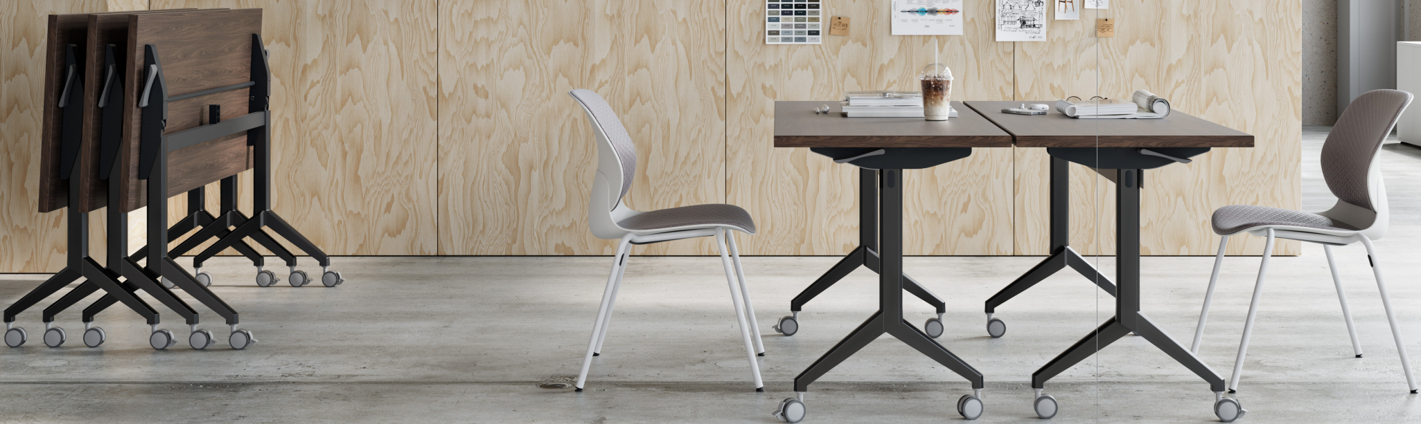
CALIBER | GRAY DRIFTWOOD TOPS | BLACK BASES

Caliber Flip & Nest Tables deliver a affordable, user-friendly solution for effortless installation; it stands out as an innovative and reliable alternative in today's market.